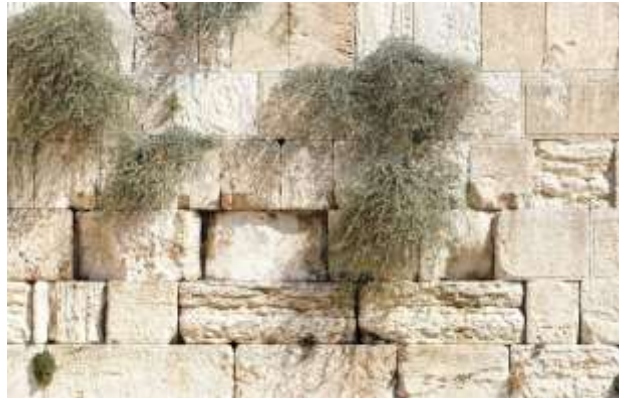
Yom Yerushalayim/Jerusalem Day