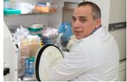
Image Gallery/Photo Albums ( https://medicine.biu.ac.il/en/gallery )